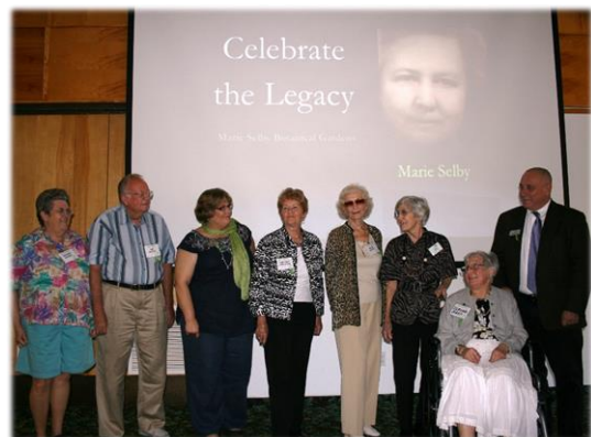
Members of the Marie Selby Legacy Society are recognized during the Annual Luncheon.