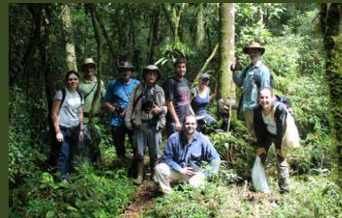
Field trip participants explore a forest in SE Brazil.