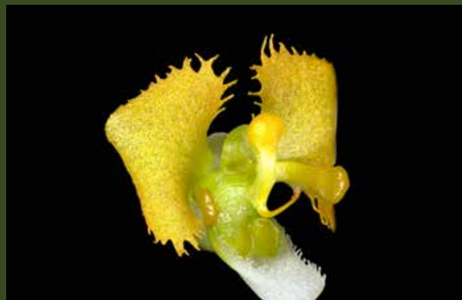
Zygostates lunata