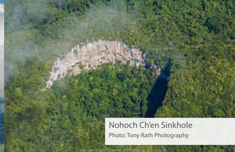
Nohoch Ch'en Sinkhole

The sinkhole sits atop the estimated 540,000 square-foot Chiquibul Cave System, the largest in Belize and the longest in Central America. The entire region is a veritable treasure chest of botanical, geological, and archeological wonders. The area has been a recent source of political tensions and conflict with neighboring Guatemala due to trespassing