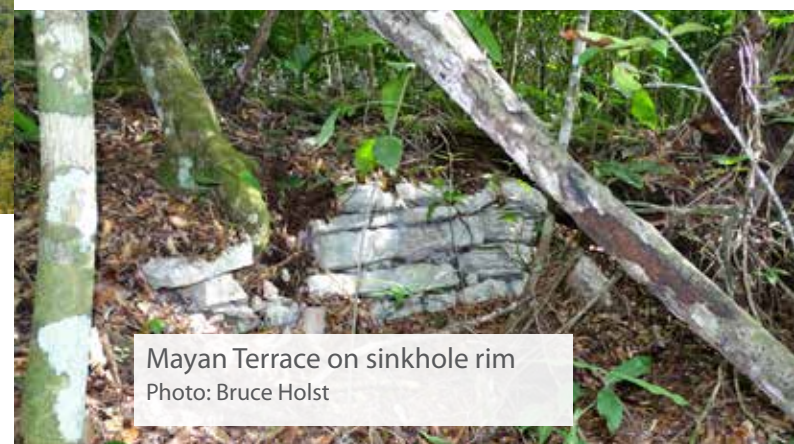
Mayan Terrace on sinkhole rim

activity that threatens the region - specifically habitat degradation, fire damage, illegal logging, hunting, and gold extraction.