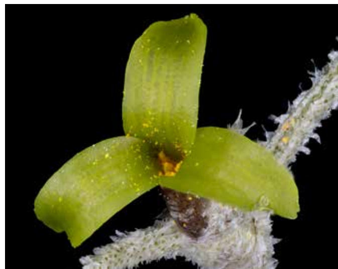
Figure 4. Tillandsia usneoides , or Spanish moss, is neither from Spain, nor is it a moss.