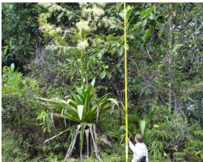
Figure 3. Brocchinia micrantha , a giant bromeliad found in eastern Venezuela and neighboring Guyana.

1980s. Lacking natural diseases and predators, the weevil has spread widely and decimated large, adult plants, having reduced some bromeliad populations by up to 90%. In addition to possibly losing this iconic plant in Florida, the multitude of organisms that live in their tanks are also at risk. Efforts at Selby Gardens to protect bromeliads include helping to map the weevil's spread, directly intervening and removing plants for safekeeping in some areas hit hard by the weevil (Figure 6), testing seed storage techniques, analyzing rates of germination, and examining seedling growth. Recent funding, secured through a private donation, will also allow us to seek potential resistant populations and evaluate the genetic diversity of the population in Florida, and elsewhere in its range. Resistant varieties could then potentially be bred and released into the wild.