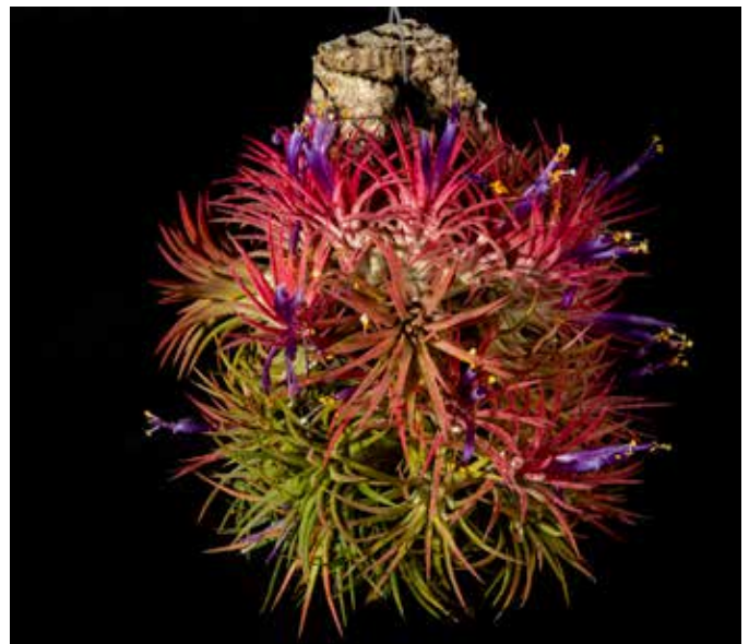
Figure 2. Tillandsia ionantha , tremendously popular in horticulture. Each plant is just a few inches long.

The most famous bromeliad, the pineapple ( Ananas comosus ), is the third most important fruit crop after bananas and citrus and is grown in 82 countries. Other important uses of bromeliads are in the pharmaceutical industry as anti-inflammatories, in fiber production, and as symbols in religious ceremonies. The most conspicuous bromeliad in the southeastern USA is Spanish moss ( Tillandsia usneoides ). If you pay close attention to Spanish moss in the spring, you will be delighted to discover its tiny, incredibly fragrant emerald-green flowers (Figure 4).