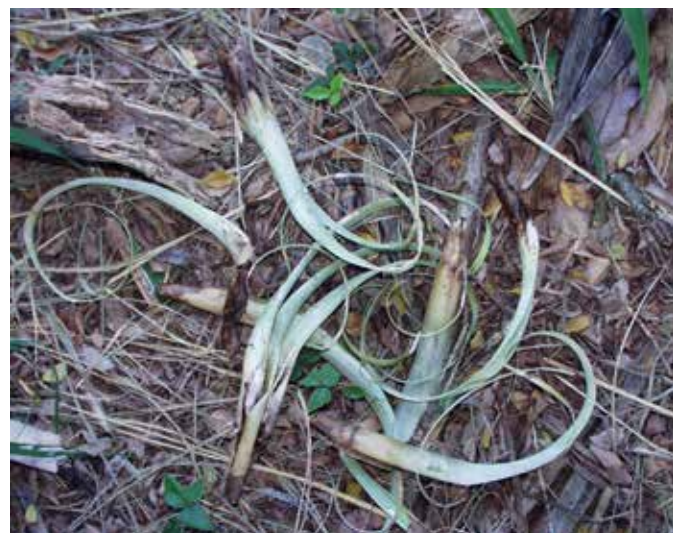
Figure 6. Plants killed by the Mexican bromeliad weevil are often found on the ground in pieces.