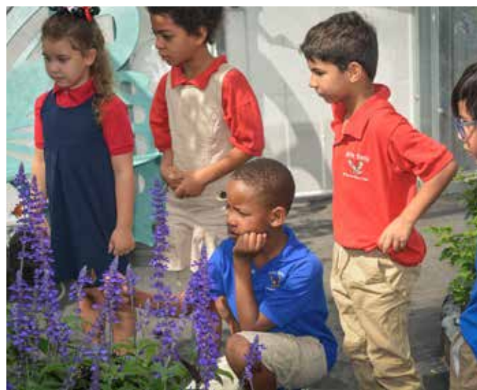
Gazing at the butterflies in the Salvador Dalí: Gardens of the Mind exhibition Butterfly House.