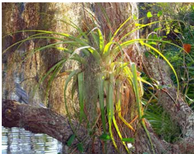
Figure 5. Tillandsia utriculata , or giant air plant at Oscar Scherer State Park.