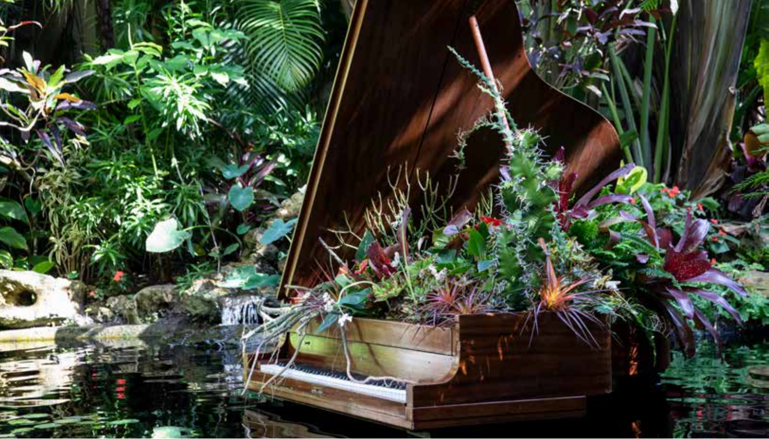
Pond to Ponder. A piano floating atop the koi pond at Salvador Dalí: Gardens of the Mind.