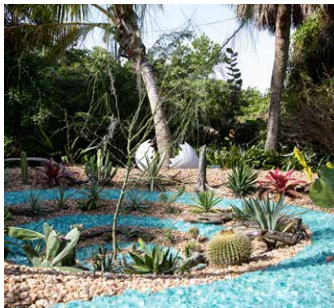
Glass Fibonacci Spiral. Divine geometry at Salvador Dalí: Gardens of the Mind.

struck up another friendship with Andy Warhol, but was by then considered by critics to have become too commercial. "The most surrealist of all his creations," one even said, "is himself". So far from selling out and becoming careless, his Flordalí works in the Selby show attest to the opposite: his continuing care, precision and imaginative wit. In 1968, he designed these images of imaginary types of flower, a Dahlia unicornis from whose flowers sprout unicorns' horns, or a Lilium musicum whose flowers give off vinyl records and musical notation. These little-known works are precise and meticulously crafted. Just as he intended, they provoke new ideas. In their wake I have been